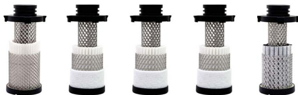
P-Grade U-Grade H-Grade S-Grade C-Grade

Note: Capacities at FAD, 7 bar g. Please contact us for details on higher pressure systems.